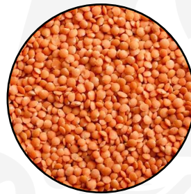
Red & Green Lentils