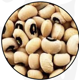
Black Eye Beans