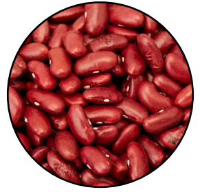
Red Kidney Beans